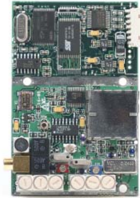
Compact Format (internal view)