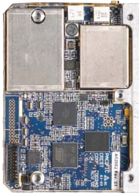
Compact Format (top interior view)