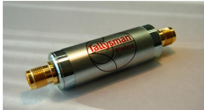
TW126 Dimensions (mm)

The TW126 passes DC supply from input to output to support centre conductor DC supply to the antenna, therefore not requiring an additional Bias source and a bias-T.